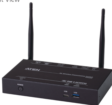
VP2020 Rear View